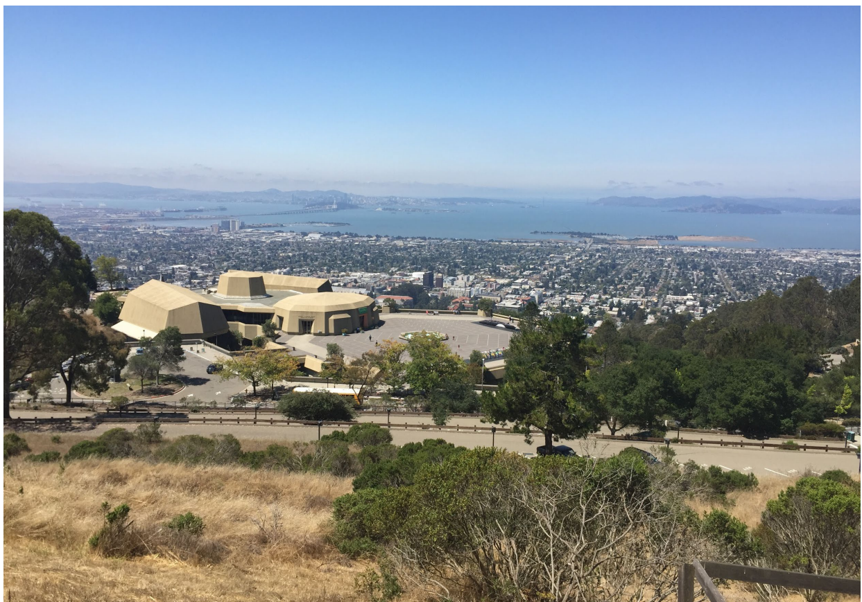
The view from above the Lawrence Hall of Science encompasses most of San Francisco Bay

driveways of the nearby houses, then proceed across a bridge and up the stone steps of Tamalpais Path. The path takes you steeply up to Tamalpais Rd. Here, turn left and go one block up to Shasta, make another left, and walk past Keith to Northgate Path. Turn right to walk up the path, which is steep and has over 200 small wooden stairs, bringing you to Northgate the street and a view to your right back down on Berkeley and the San Francisco Bay. Go up the street a block and stay right to continue on Quail Ave. Take this to where it ends after two blocks and turn right. Very quickly you will reach Glendale Path; turn left and go up the steps one block. Here, make a right (on Fairlawn), then stay left at the intersection with Queens. After one long block, make a slight right onto Avenida, then a nearly immediate left onto Olympus. Take Olympus to where it dead-ends and continue straight onto a small trail which will lead you to the Lawrence Hall of Science, past a great view down on Berkeley.