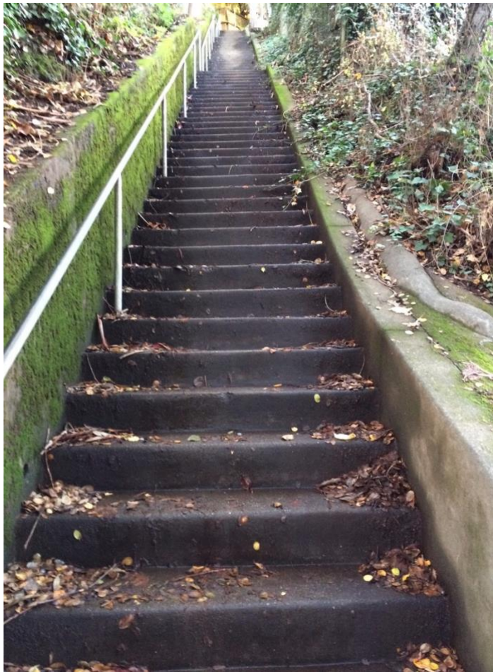
Left: Arden Steps, in the more tiring direction

A fifth of a mile later, Panoramic curves again. Here, make a left down Arden Path, which, for once, does have a street sign. At the bottom of the wooden steps, make a slight right to continue down Arden Steps. This path has so many concrete steps with so few landings that it appears to simply drop off. Luckily there's a handrail! At the bottom, make a left down Mosswood Rd, continuing to where it curves, then making a slight right onto Mosswood Lane, our favorite path in this area. After descending a few steps, the path becomes a dirt trail through redwoods and over padded needly ground. It ends with a concrete staircase down to Orchard Lane and the now familiar "path intersection." Make a right and go down the steps to Panoramic. Turn right, then left on Bancroft and left on Prospect St.